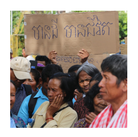
Krang Tbaeng Kampong Speu p.10-11