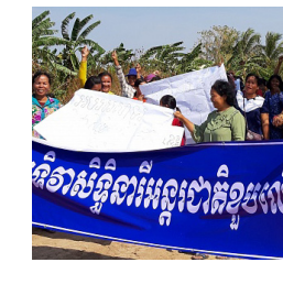
Boeung Pram Battambang p.24-25