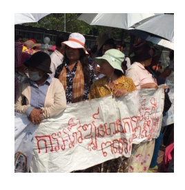
Phum 17 Phnom Penh p.36-37